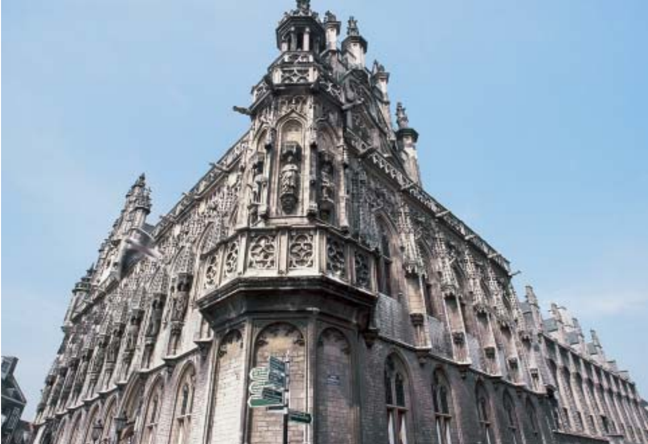
↑ The Town Hall