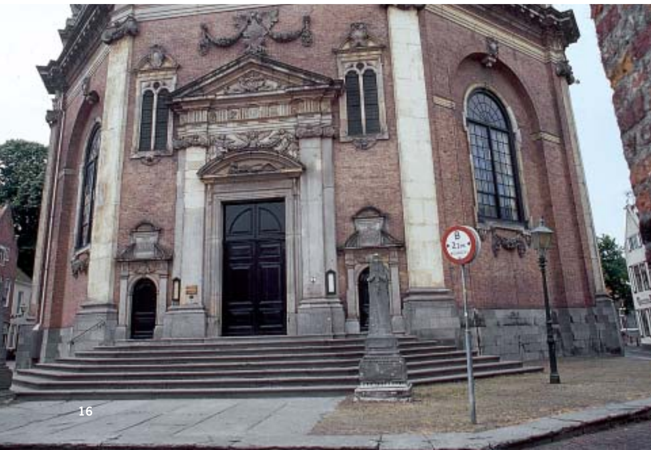
De Oostkerk/The East Church ↓