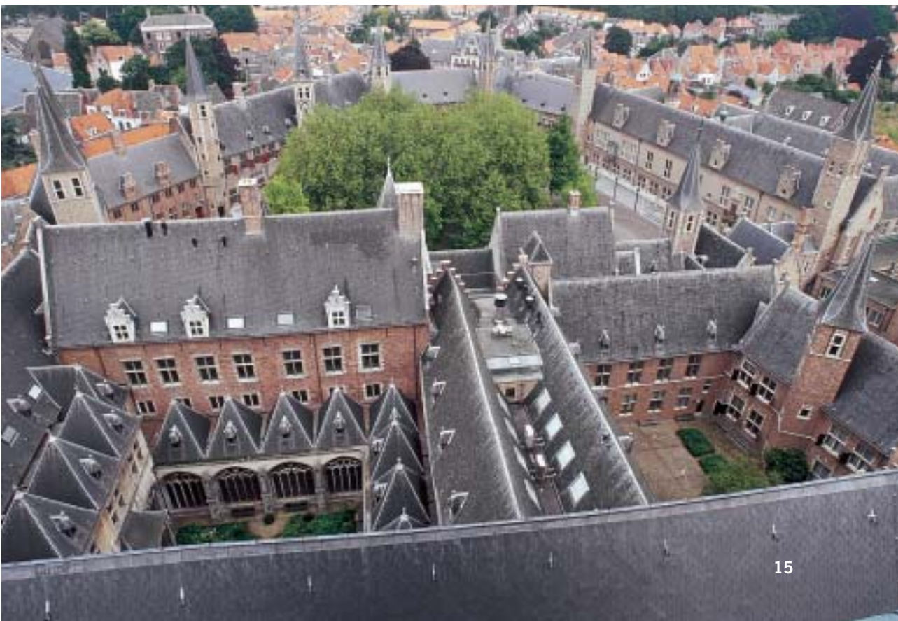
The Abbey buildings ↓