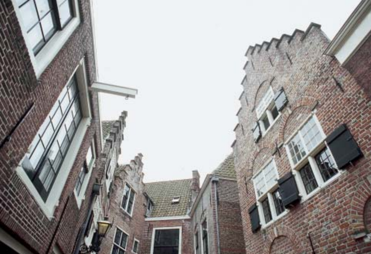
↑ De Kuiperspoort/Coopers' Gate