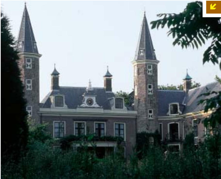
↑ Slot Ter Hooge

seen in the reconstructed façade of the Sint Jorisdoelen . Continue your stroll along the Wagenaarstraat , where number 1 is an enormous mansion dating from 1730. On your right, via Achter het Hofplein , you get a good view through to the Gothic wooden façade of the Sint Pieter house: it originally came from the Lange Delft, but has been 'stuck onto' the side wall here. The Van de Perrehuis stands proudly on the Hofplein . It is a remarkable building, with a characteristic concave main façade, the house being named after the first owner of this former 18th century town palace, the wealthy Van de Perre. The Zeeland Archives are at present housed here, after the building had been thoroughly renovated and a daringly-designed transparent extra space added.